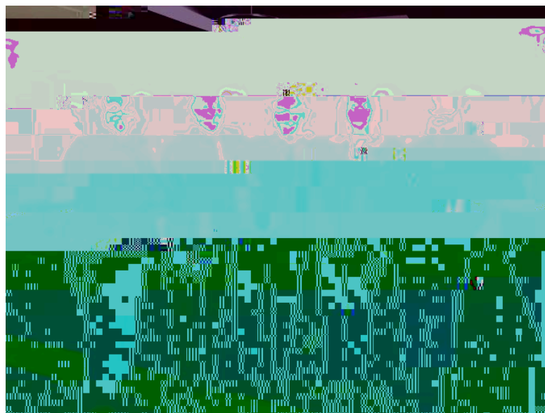
UMSAEP's team (Missouri& UWC)