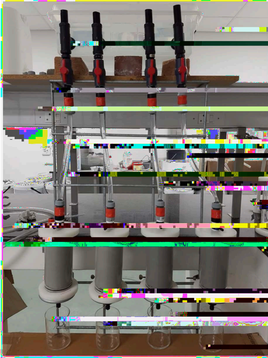
Figure 5. Acid mine drainage neutralization testing

The aim of this study was to investigate the neutralization capacity of columns of Kendal and Lethabo fly ash for the treatment of Eyethu AMD. The experiment was successful as it was proven that Eyethu AMD can be treated by passively flow through coal fly ash. The pH was raised from 2 to over 12 by the dissolution of oxide component in the ash and hydrolysis of the major and trace elements in AMD once in touch with coal fly ash. There was a substantial removal of metals including Fe, Al, Mn and Mg and removal of some other elements during this study as the pH was increasing over contact time. This study highlights three major parameters to take in consideration if passively treating AMD in columns with FA (AMD: FA ratio, the contact time, and the chemistry of the acid mine drainage). The bedvolumes of acid mine drainage used before the fly ash was exhausted was approximately 44 and show that the Kendal fly ash has a significant durability to act as a passive barrier.