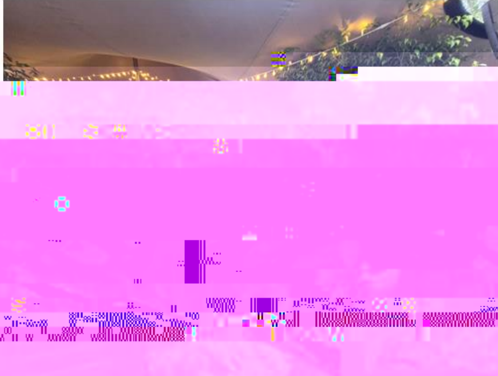
The courtyard at the restaurant where we celebrated the completion of our focus groups.